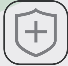
Silicone protective case