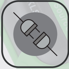
Plug and play