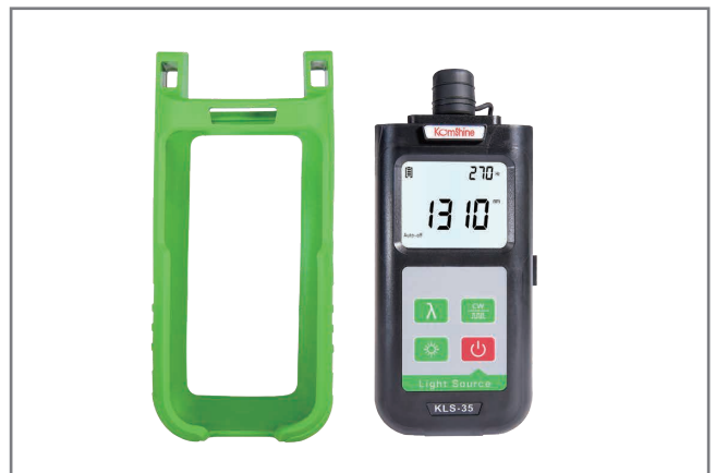
Detachable protective sleeve